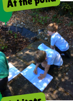
At the pond

We have become animal experts through our Science topic, learning different habitats and the animals which live there. We looked at large habitats around the world and more locally, including animals we can find in microhabitats in our school grounds. Food chains have helped us learn how animals feed and survive in the wild. We saw many of these animals on our trip to Marwell Zoo.